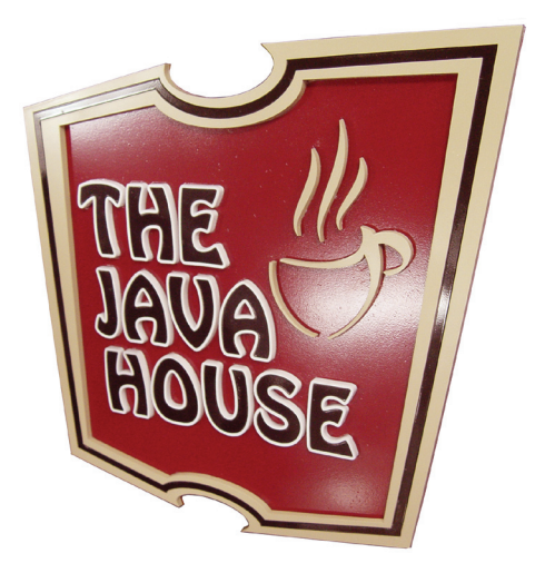
The completed 3D sign, ready for display.